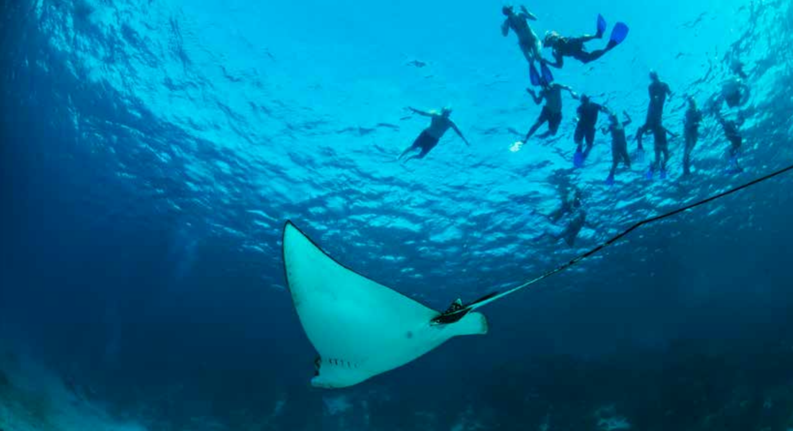
Belize Tourist Board