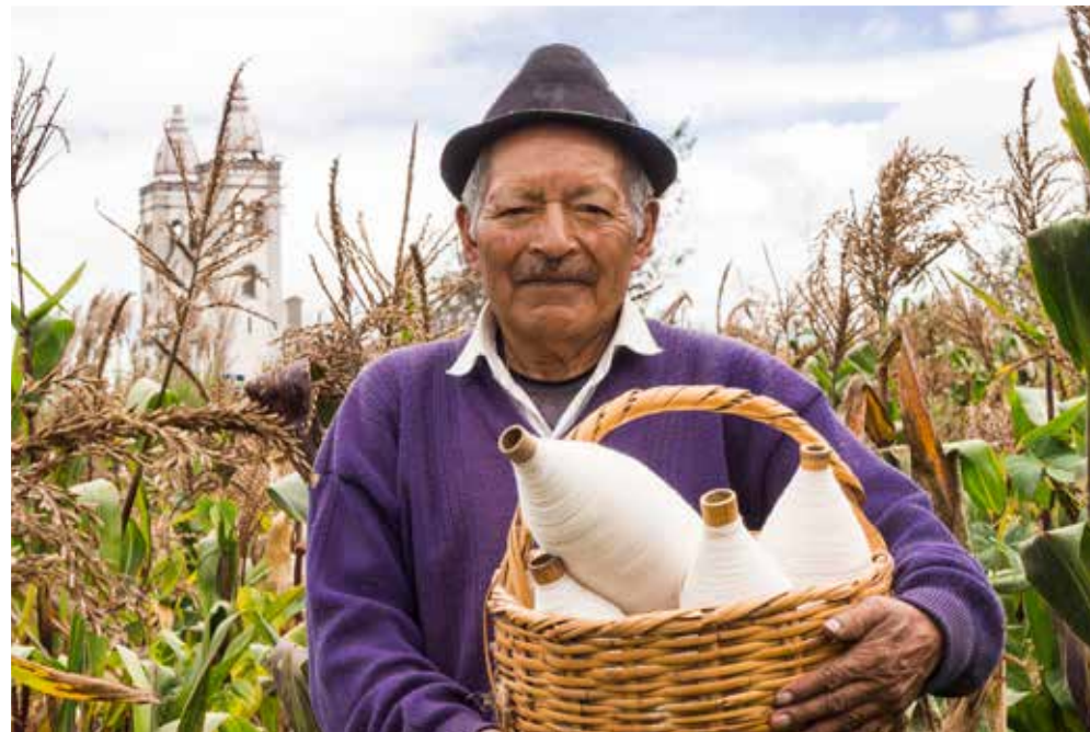
Journey Latin America

This year we are delighted to launch our brand new travel wallets, handwoven by local artisans near the Cotopaxi volcano in the Ecuadorian Andes. The local artisans we worked with on this project live two hours outside the capital, Quito. Spinning and weaving are an integral part of the fabric of their community, providing a stable income without the need to commute long distances into the city. We coordinated with SUSPIRO, who empower and promote the handmade work of textile artisans living in Ecuador's Andes. They told us that "The wallet project was really important to keep the spirits up among the artisans and seamstresses."