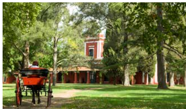
Estancia La Bamba

In colonial times, large tracts of land in Latin America were divided into estates-estancias or haciendas, which had elegant, palatial residences. Some have been refurbished and opened up to visitors: a few have been converted into luxury hotels, and a number are still operating ranches or wineries. They offer visitors a warm family-style welcome, excellent facilities and a range of activities from wine-tasting and bird-watching to nature trails and horse riding. One of our favourites is La Bamba in Argentina, but you can also spend several days unwinding in estancias in Chile, Mexico or Ecuador.